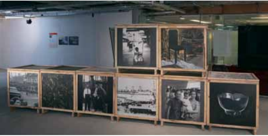
Left: Celia Ko, Crated Memories , 2010, mixed-media images on crates, approx. 582.5 x 975 x 213.3 cm, 2010. Courtesy of the artist.

Right: Celia Ko, Crated Memories , 2010, mixed-media images on crates, approx. 582.5 x 975 x 213.3 cm, 2010. Courtesy of the artist.