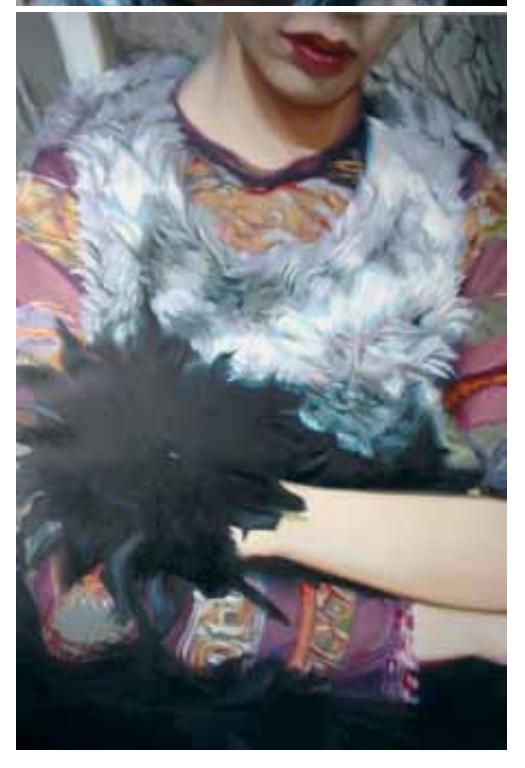
Celia Ko, Boy Landscape III , 2004, oil on canvas, 122 x 183 cm. Courtesy of the artist.