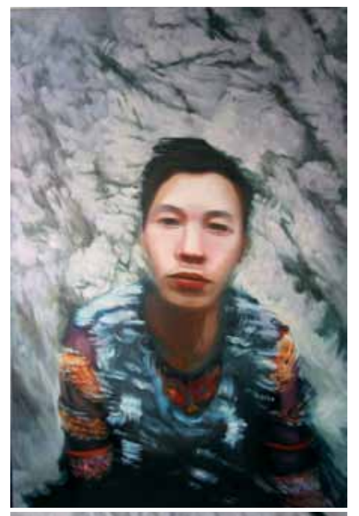
Celia Ko, Boy Landscape I , 2004, oil on linen, 122 x 183 cm.